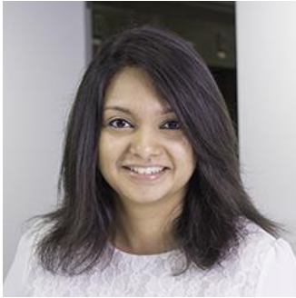
CORAL PAIS, PE, BEMP