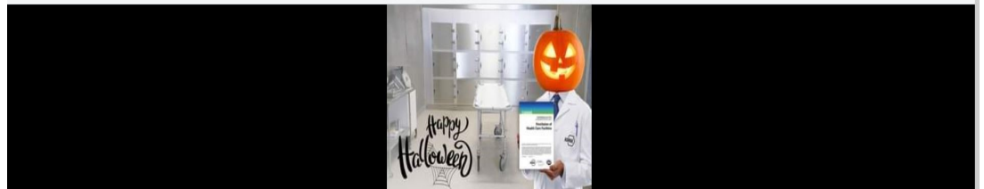
ASHRAE What better way to celebrate Halloween than by indulging in a scary movie? And, what's a spookier setting for a scene than a morgue? In the real world, ASHRAE sets the standard for those morgues, as well as autopsy rooms, with guidance from ANSI/ASHRAE/ASHE Standard 170, Ventilation of Health Care Facilities. Happy Halloween! https://bit.ly/3356QhN

Warm greetings from your local chapter President and the Board of Governors, during this crisp but wet October Fall season! As I was drafting this month's newsletter, I came across this ASHRAE Society's clip on their Facebook page from 2019, that I wanted to share. I find it really interesting to note that ASHRAE'S influence on the built environment extends to both the living and the dead! Cleveland being a hub of medical centers and research facilities, and with the ASHRAE's Epidemic Task Force and Building Readiness guidelines released during the current pandemic, this focus on healthcare facilities seems even more relevant.